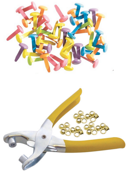
split pins and eyelet punch

Hello and well done on gaining a place at Plymouth College of Art on BA (Hons) Animation .